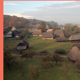
ETHNOGRAPHIC PARK OF CLUJ-NAPOCA