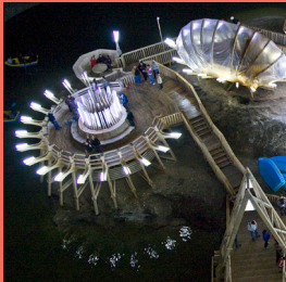
TURDA SALT MINE