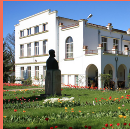
BOTANICAL GARDEN OF CLUJ-NAPOCA